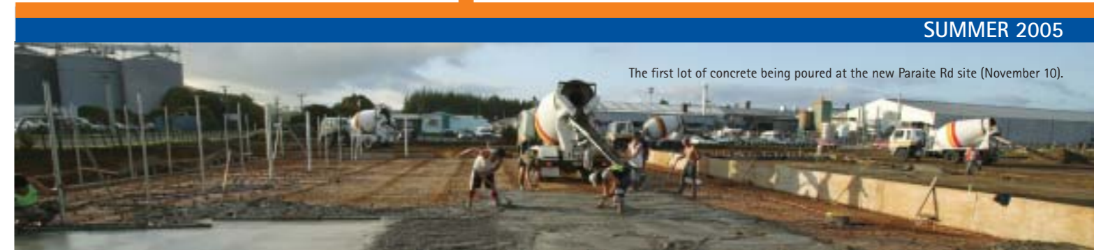
The first lot of concrete being poured at the new Paraité Rd site (November 10).